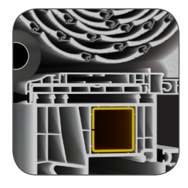
universal adapter fitting any window