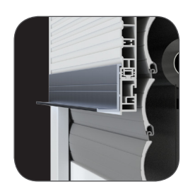
possibility to encase the box inside and out